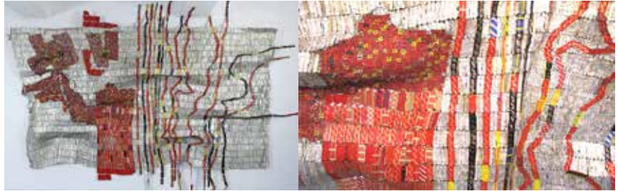
El Anatsui, Afor, 2010

“I’m sure I don’t know half the people who come into my house. Indeed, from all I hear. I shouldn’t like to.” Oscar Wilde