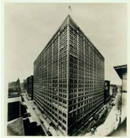
The Railway Exchange Building, 611 Olive Street, downtown St. Louis. Photographic print by W. C. Persons, 1915. Missouri History Museum.